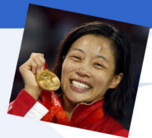
2008 Olympic Champion Carol Huynh

This world class tournament will take place November 5th Guildford Recreation Center in Surrey, British Columbia, Canada. The Hargobind International represents the spirit of friendship, sportsmanship and goodwill among the many federations that participate.