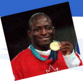
2000 Olympic Champion Daniel Igali